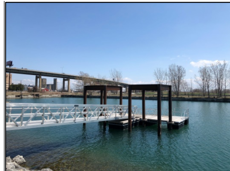
Figure 4 - Anticipated Location at Wilkeson Pointe