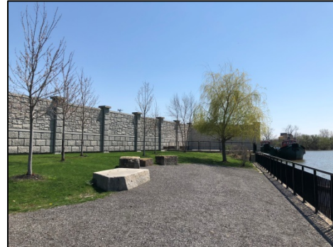
Figure 3 - Anticipated Location at Mutual Riverfront Park