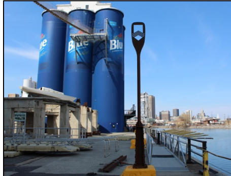
Figure 1- Marker Prototype

Two Blueway Markers, one to be installed at Mutual Riverfront Park and one at Wilkeson Pointe. The Markers are intended to be fabricated out of steel and be replicas of the prototype installed at RiverWorks in 2018 (see photos in Figures 1 and 2 below). In coordination with BNW, Vendor is expected to propose modifications to the prototype to best fit the locations (size, base, installation method, etc.) The marker at Mutual Riverfront Park (Figure 3) is anticipated to be installed on a gravel plaza deck behind a concrete seawall and the marker at Wilkeson Pointe (Figure 4) is anticipated to be installed on top of the existing steel paddle craft launch frame. Vendors are encouraged to view the prototype Blueway Marker installed on the RiverWorks dock which is open to the public.