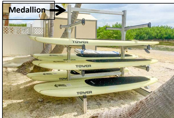
Figure 7 - Example Kayak Storage Rack and Medallion Mounting Location