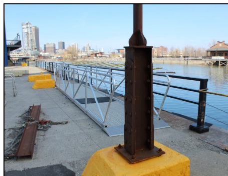
Figure 2 - Marker Prototype Base