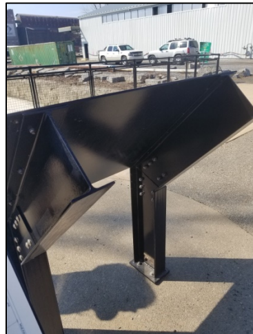
Figure 6 - Back of Sign to be used as model

In close coordination with BNW and our marketing team, the Vendor will design two steel water-facing signs featuring the Buffalo Blueway logo to be affixed to railings at Mutual Riverfront Park and one at Wilkeson Pointe. The Vendor is expected to determine the size of the signs and the appropriate mounting method.