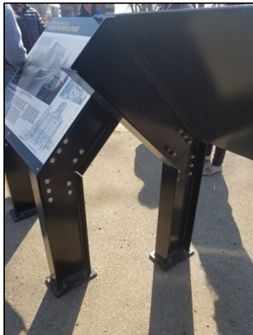
Figure 5 - Sign to be used as model

Three steel sign frames and bases to accommodate 24" x 36" interpretive signs (actual signs to be provided) similar to those shown in the picture below are to be installed (one per site) at Buffalo RiverWorks, Mutual Riverfront Park, and Wilkeson Pointe. The frames will be uniform in design per site, however the Vendor is expected to modify the bases, as needed, dependent upon the site conditions and installation locations. It is anticipated that bases will be installed on concrete at RiverWorks and will need to be embedded into the ground at Mutual Riverfront Park and Wilkeson Pointe. Vendors are also encouraged to view the industrial steel interpretive sign frames/bases located on the public right-of-way along Ohio Street.