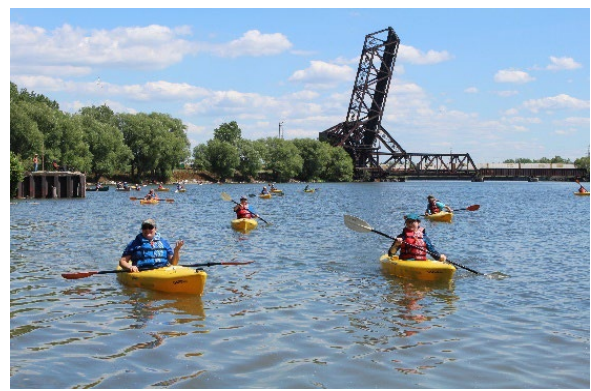
Figure2. Red Jacket Riverfront Natural Habitat Park trails (left) and kayakers (right)