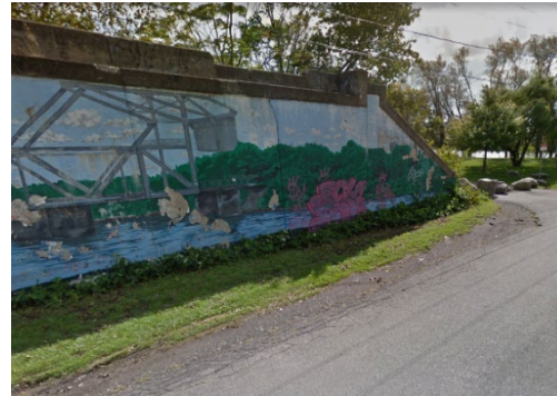
Figure3. Existing murals at the entrance to the Park

Applicants are encouraged to visit the site and view the existing mural conditions prior to applying. The Park offers parking and is open from dusk to dawn. Please visit the Erie County website for more information: https://www3.erie.gov/parks/red-jacket-riverfront-natural-habitat-park